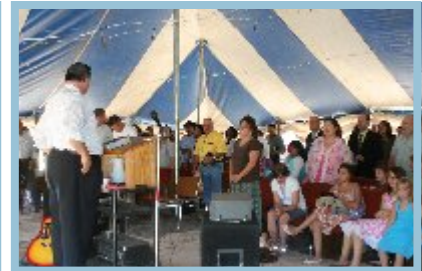
Inside the tent on Sunday AM