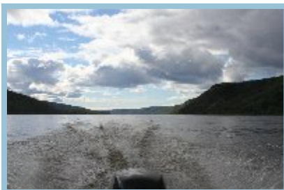
The Yukon River