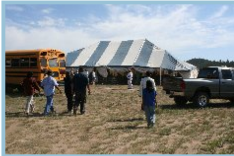
Tent set up on Jicarilla Apache Res.