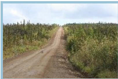
Part of 12 hour drive to Yukon River