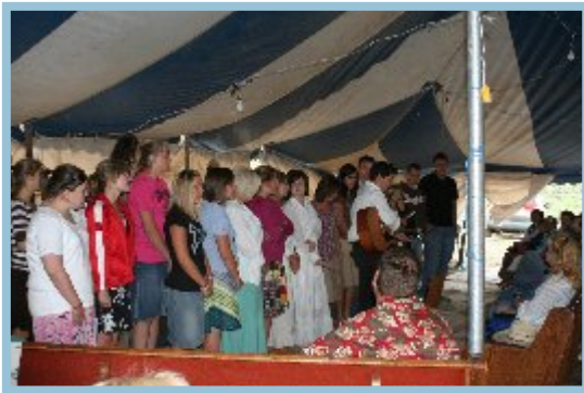
Young people from Temple Baptist singing in the service