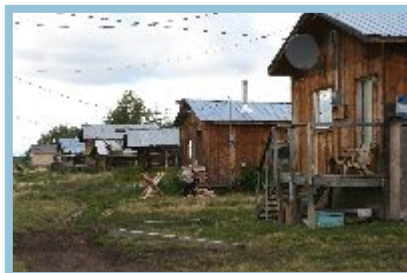
A typical village on the Yukon