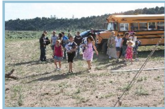
People arriving for the services