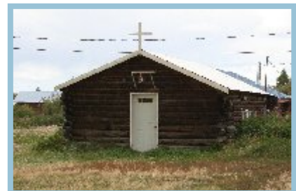
Church in village of Stephens, ALA